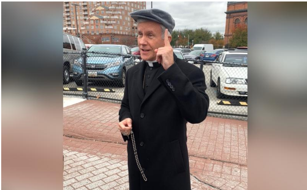
Bishop Joseph Strickland visits Catholics rallying outside USCCB meeting Nov. 13, 2018.